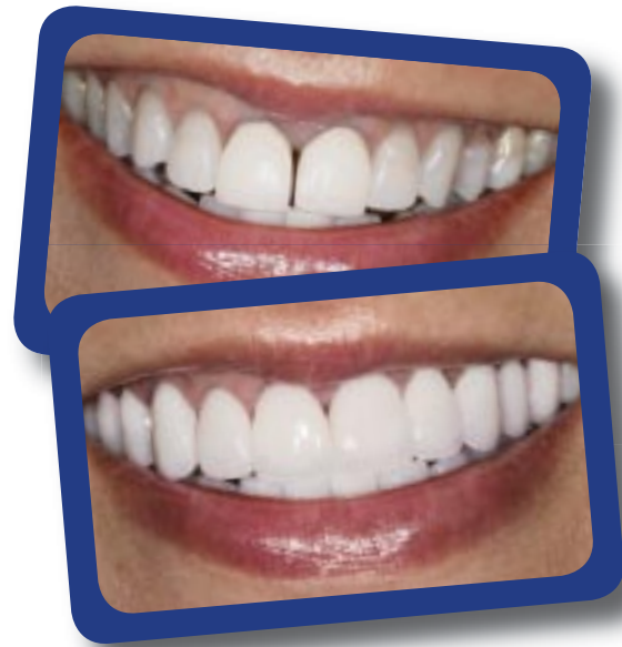
New beautiful natural-looking front crowns are enhanced by veneers on the molars.

Crowns have come such a long way from the all-metal originals, through porcelain fused to metal, and finally to all-ceramic or all-porcelain. Today, replacing outdated crowns is a surefire way to take years off your appearance.